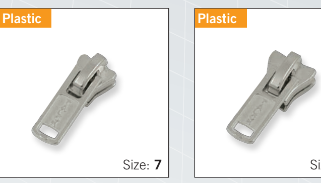
Autolock Slider with "DA" pull