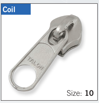
Nonlock slider with "DFL" pull