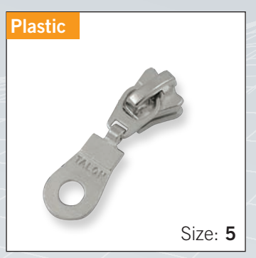
Autolock Slider with "DAMSL" pull