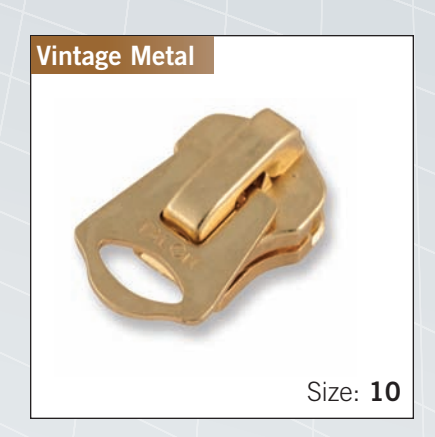
Autolock slider with "6221" pull