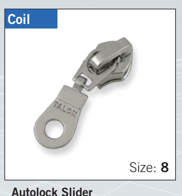
Autolock Slider with "DAMSL" pull