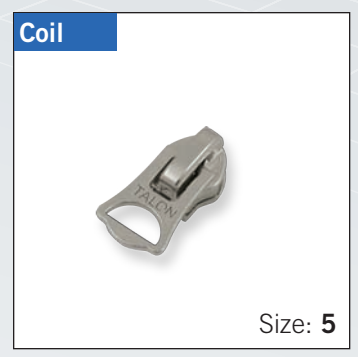
Autolock Slider with "PDN#00323" pull