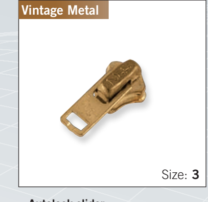
Autolock slider with "AL 601" pull