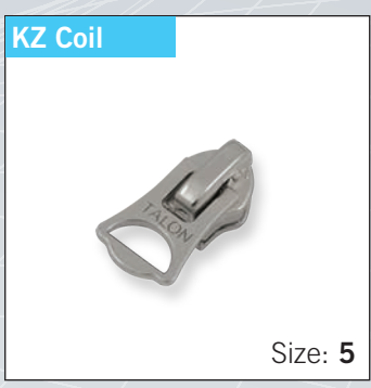
KZ Autolock Slider with "PDN00323" pull