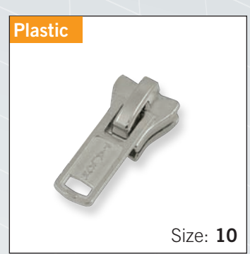
Autolock Slider with "DA" pull