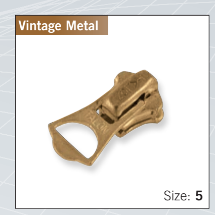
Autolock slider with "AL 62210" pull