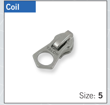
Autolock Slider with "TADCA01" pull