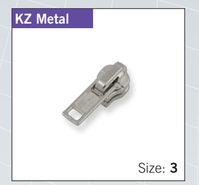
KZ Autolock Slider with "DA" pull

and pose a potential choking hazard to kids. Redesigned and crafted from reinforced materials, Talon KidZip zippers are considerably stronger and safer than the traditional small sized zipper typically used in children's garments. The slider pulls are specially designed to withstand greater pull-off and torque twist loads, and they all meet or exceed the strength requirements of ASTM F 963 and Part 16, CFR 1500. The raw materials used in the manufacture of these sliders are free of lead and other heavy metals and are fully compliant with the latest safety requirements for children's products, including CPSIA 2008.