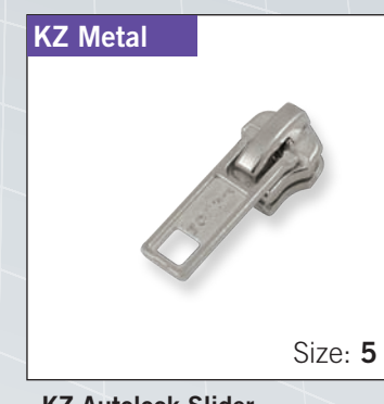
KZ Autolock Slider with "DA" pull