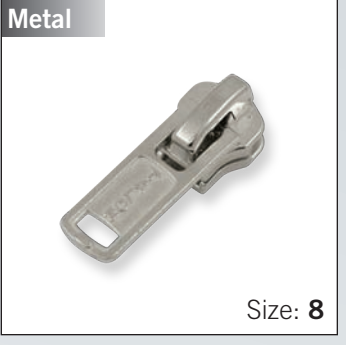
Autolock Slider with "DA" pull