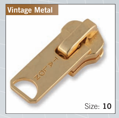
Autolock slider with "PDN#00875" pull