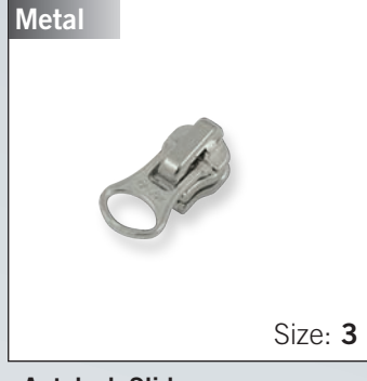
Autolock Slider with "DALH" pull