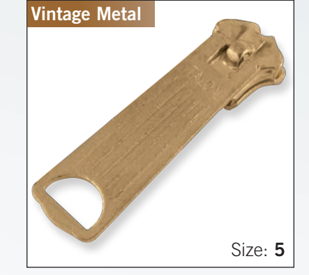
Nonlock slider with "NL1043" pull