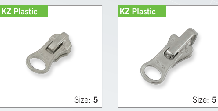
KZ Autolock Slider KZ Reversible Autolock Slider with "DALH" pull with "DALH" pull