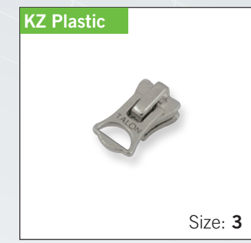
KZ Autolock Slider with "PDN00672" pull