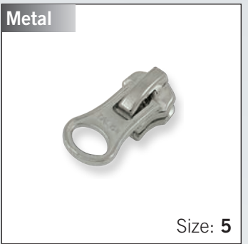
Autolock Slider with "DALH" pull