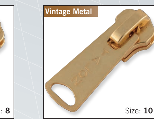
Autolock slider with "6243" pull