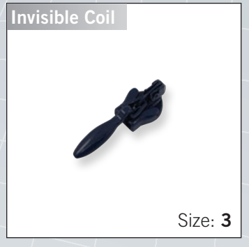
Invisible Autolock Slider with "Teardrop" pull