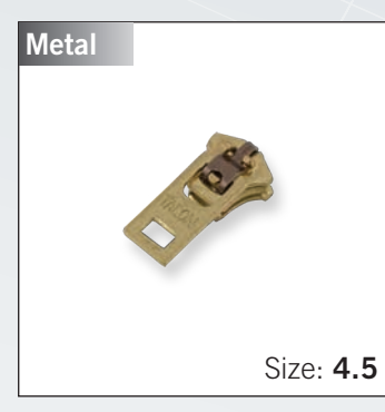
Semi-Autolock Slider with "Rectangular" pull