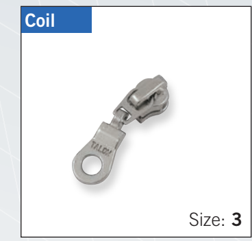
Autolock Slider with "DAMSL" pull