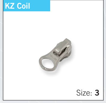
KZ Autolock Slider with "DALH" pull