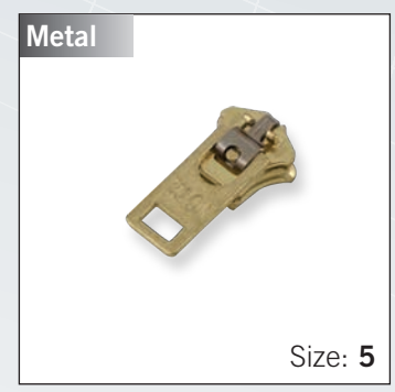
Semi-Autolock Slider with "Rectangular" pull