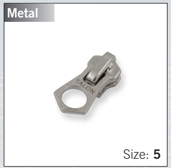
Autolock Slider with "TADCA01" pull