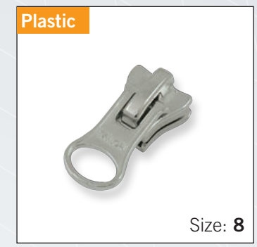
Autolock Slider with "DALH" pull