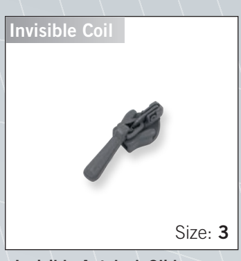
Invisible Autolock Slider with "Diamond" pull