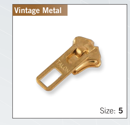
Nonlock slider with "NL1010" pull