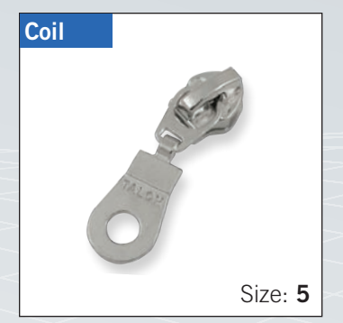
Autolock Slider with "DAMSL" pull