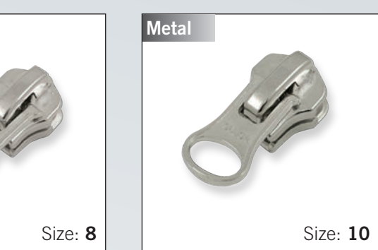
Autolock Slider with "DALH" pull