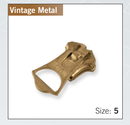
Nonlock slider with "NL10210" pull