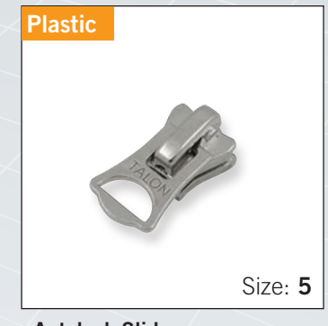
Autolock Slider with "PDN00672" pull