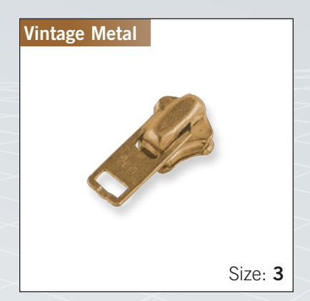
Autolock slider with "AL 600" pull