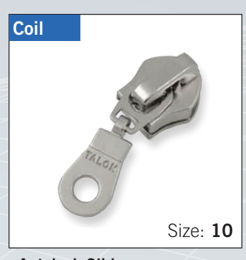
Autolock Slider with "DAMSL" pull