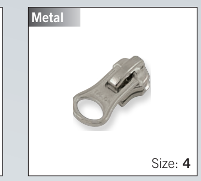
Autolock Slider with "DALH" pull