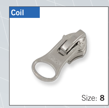
Autolock Slider with "DALH" pull