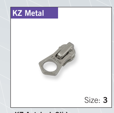
KZ Autolock Slider with "TADCA01" pull