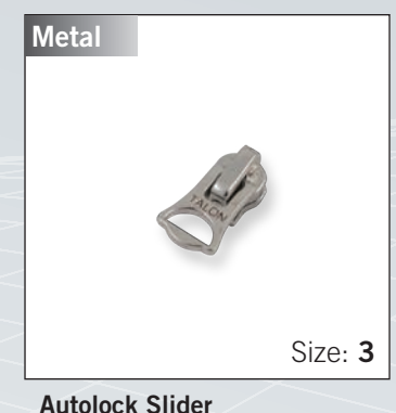
Autolock Slider with "PDN00672" pull