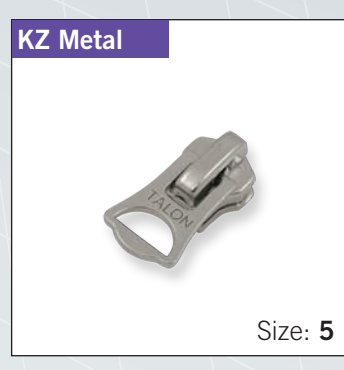
KZ Autolock Slider with "PDN00323" pull