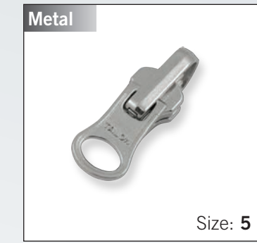
Reversible Autolock Slider with "DALH" pull