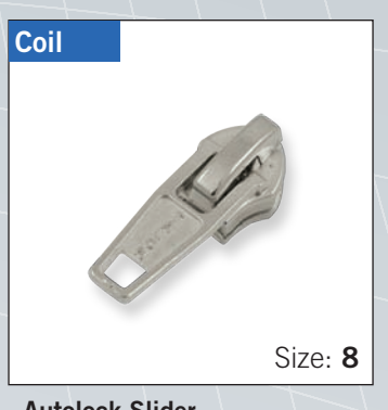
Autolock Slider with "DA" pull