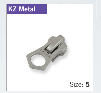
KZ Autolock Slider with "TADCA01" pull