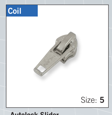
Autolock Slider with "DA" pull