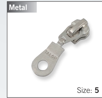
Autolock Slider with "DAMSL" pull