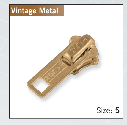
Autolock slider with "AL 6210" pull