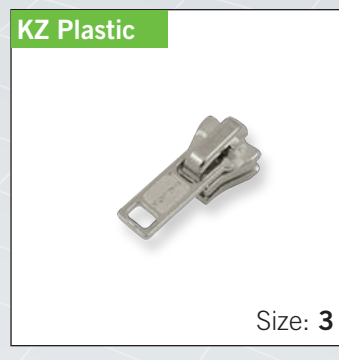
KZ Autolock Slider with "DA" pull