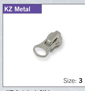
KZ Autolock Slider with "DALH" pull