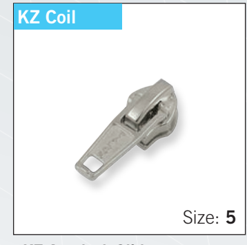
KZ Autolock Slider with "DA" pull