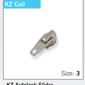
KZ Autolock Slider with "DA" pull