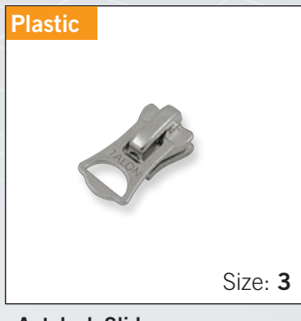
Autolock Slider with "PDN00672" pull