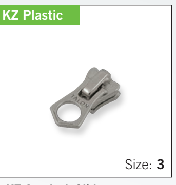
KZ Autolock Slider with "TADCA01" pull