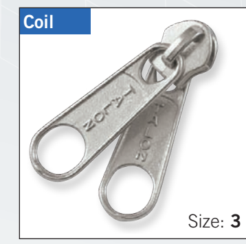
Nonlock slider with double "DFL" pulls