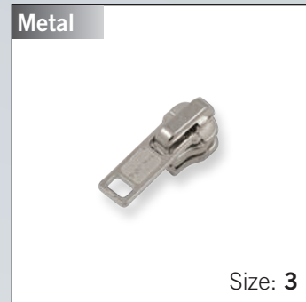
Autolock Slider with "DA" pull