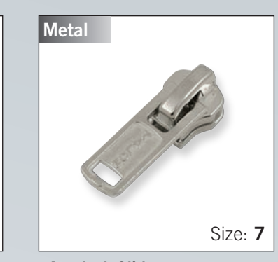
Autolock Slider with "DA" pull