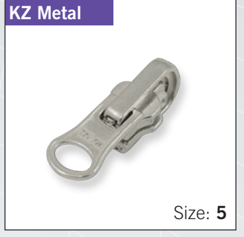
KZ reversible Autolock Slider with "DALH" pull