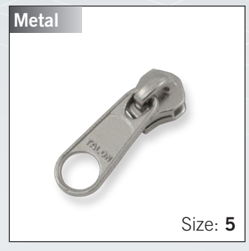
Nonlock Slider with "PDN00615" pull