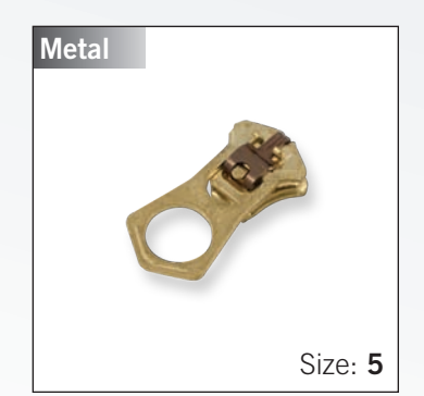
Semi-Autolock Slider with "TADCF01" pull