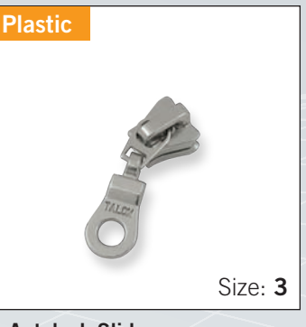
Autolock Slider with "DAMSL" pull