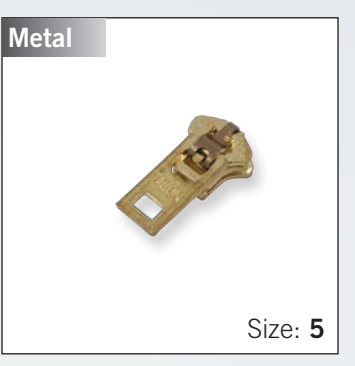
Semi-Autolock Slider with "Rectangular" pull