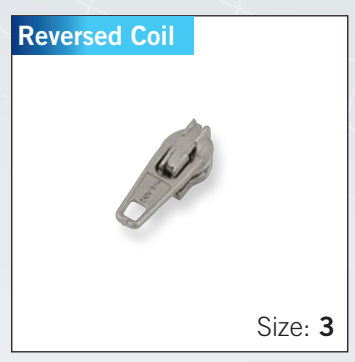
Reversed Coil Autolock with "DA" pull