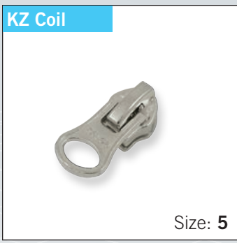
KZ Autolock Slider with "DALH" pull