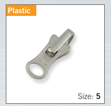
Reversible Autolock Slider with "DALH" pull