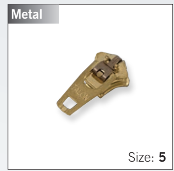
Semi-Autolock Slider with "Tapered" pull