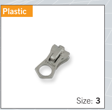
Autolock Slider with "TADCA01" pull