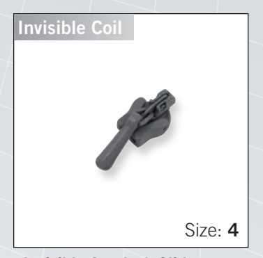
Invisible Autolock Slider with "Diamond" pull