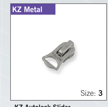
KZ Autolock Slider with "PDN00672" pull