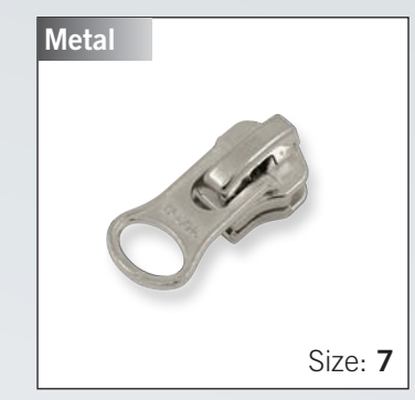
Autolock Slider with "DALH" pull