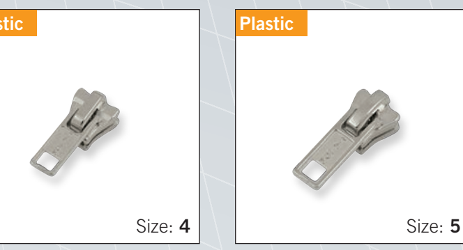
Autolock Slider with "DA" pull