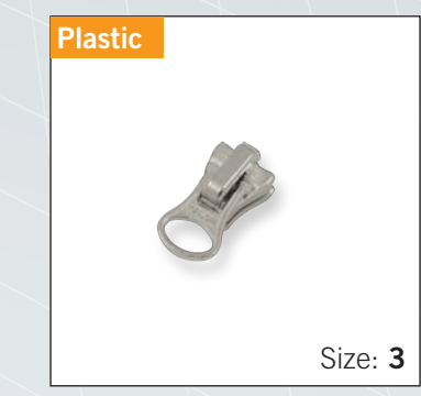
Autolock Slider with "DALH" pull