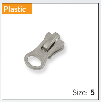
Autolock Slider with "DALH" pull