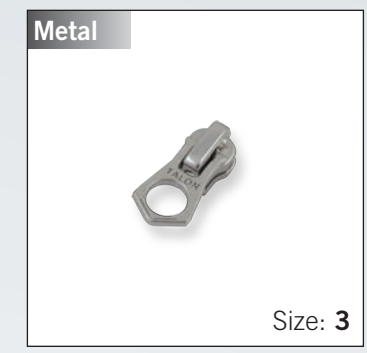
Autolock Slider with "TADCA01" pull