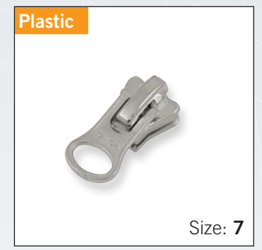
Autolock Slider with "DALH" pull