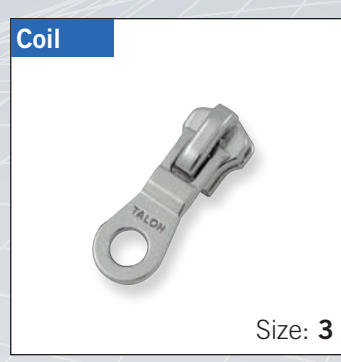
Autolock Slider with "PDN00112" pull