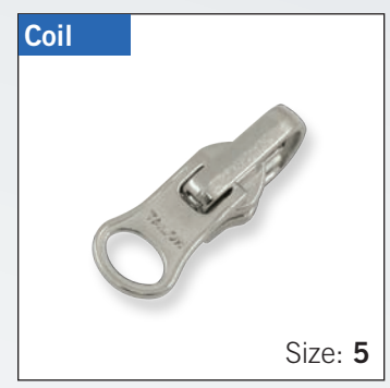
Reversible Autolock Slider with "DALH" pull