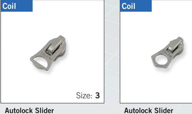
Autolock Slider with "PDN#00672" pull with "TADCA01" pull