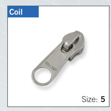
Nonlock slider with "DFL" pull