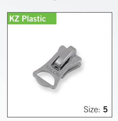
KZ Autolock Slider with "PDN00323" pull