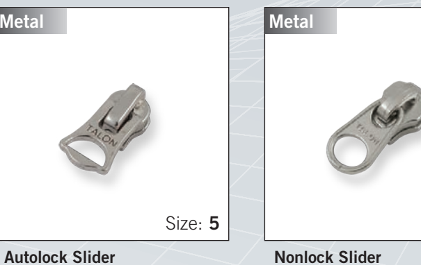
Nonlock Slider with "PDN00609" pull