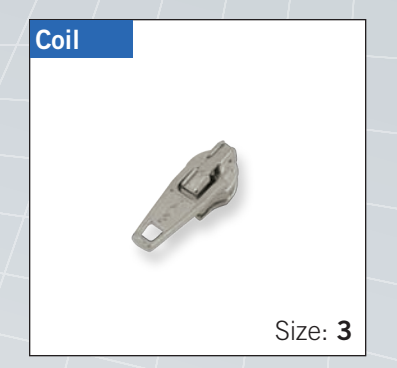
Autolock Slider with "DA" pull