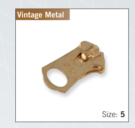
Nonlock slider with "NL1021" pull