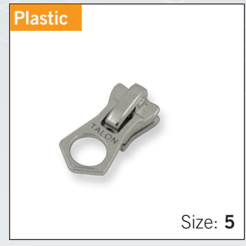
Autolock Slider with "TADCA01" pull