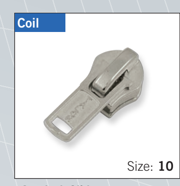
Autolock Slider with "DA" pull