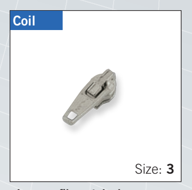
Low-profile autolock slider with "DA" pull