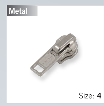
Autolock Slider with "DA" pull