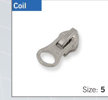
Autolock Slider with "DALH" pull