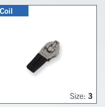
Semi-Autolock Slider with "DSYG" pull