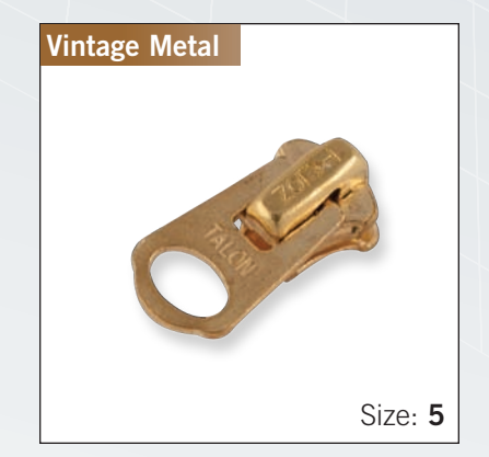
Autolock slider with "AL 6221" pull