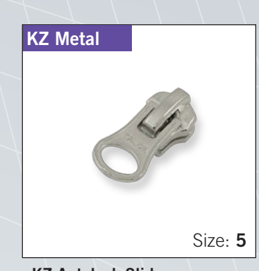
KZ Autolock Slider with "DALH" pull