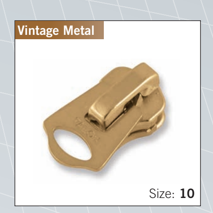
Autolock slider with "6221" pull