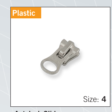
Autolock Slider with "DALH" pull