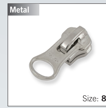
Autolock Slider with "DALH" pull