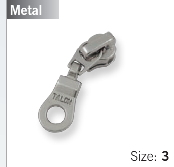
Autolock Slider with "DAMSL" pull