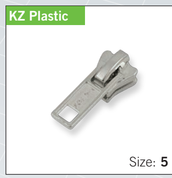
KZ Autolock Slider with "DA" pull