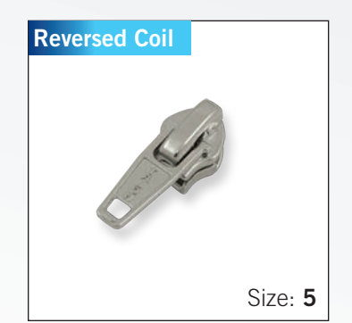
Reversed Coil Autolock with "DA" pull