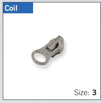
Autolock Slider with "DALH" pull