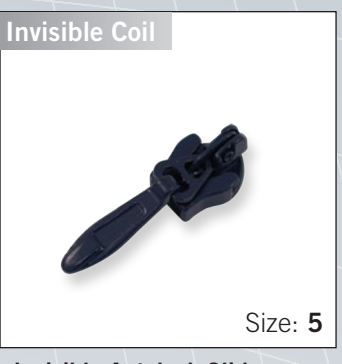
Invisible Autolock Slider with "Teardrop" pull