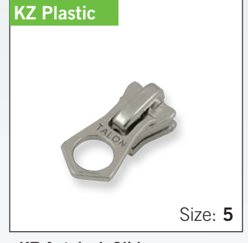
KZ Autolock Slider with "TADCA01" pull