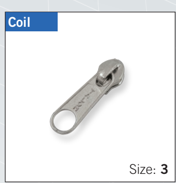
Nonlock slider with "DFL" pull