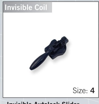
Invisible Autolock Slider with "Teardrop" pull