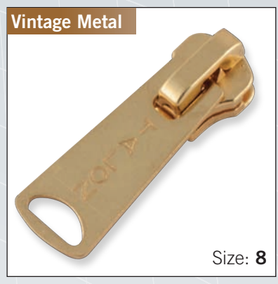
Autolock slider with "6243" pull