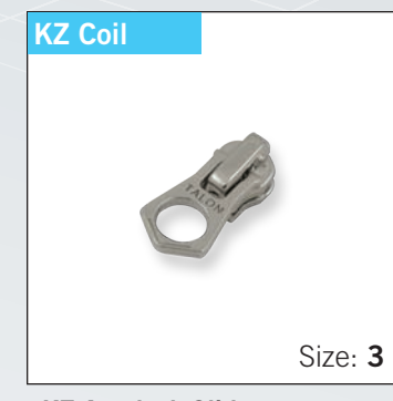
KZ Autolock Slider with "TADCA01" pull