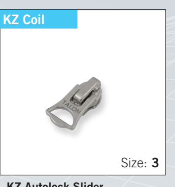
KZ Autolock Slider with "PDN00672" pull