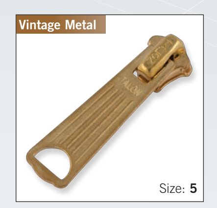
Autolock slider with "AL 6243" pull