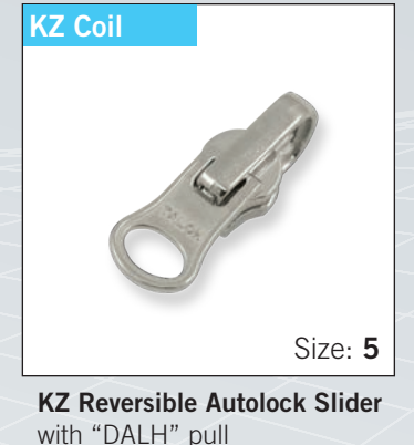
with "DALH" pull