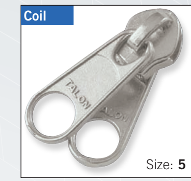
Nonlock slider with double "DFL" pulls