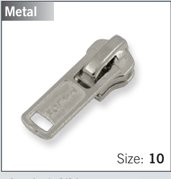
Autolock Slider with "DA" pull