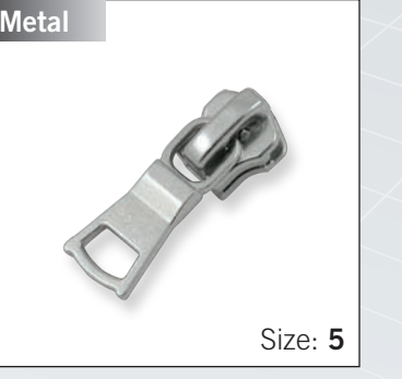
Autolock Slider with "R3S" pull