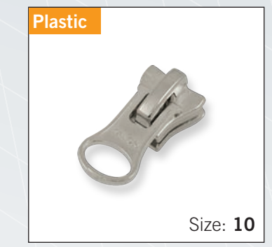
Autolock Slider with "DALH" pull