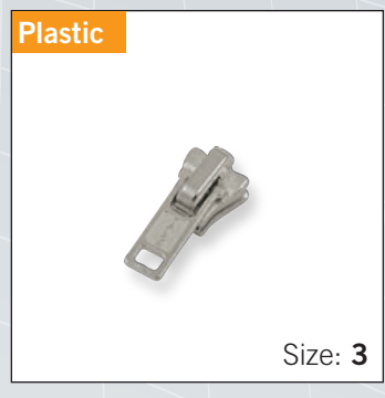
Autolock Slider Autolock Slider with "DA" pull with "DA" pull