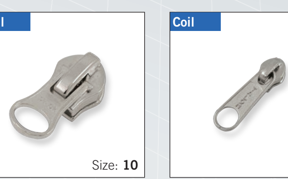
Autolock Slider with "DALH" pull