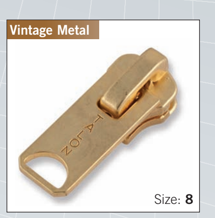
Autolock slider with "PDN#00875" pull