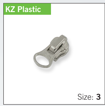
KZ Autolock Slider with "DALH" pull