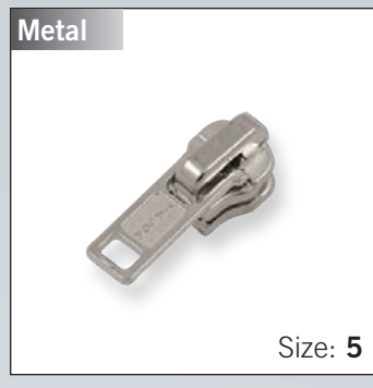
Autolock Slider with "DA" pull