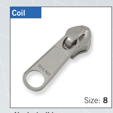
Nonlock slider with "DFL" pull