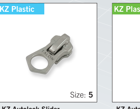
KZ Autolock Slider with "TADCA01" pull